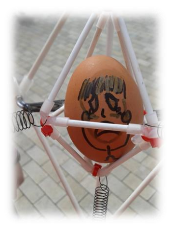
Fig. 1. The egg survivor

It is a great opportunity to apply a theory we had learned in physics class with a view to performing a challenge that might seem complicated: to avoid an egg breaking on the roller-coaster, motivated us to work in this project.